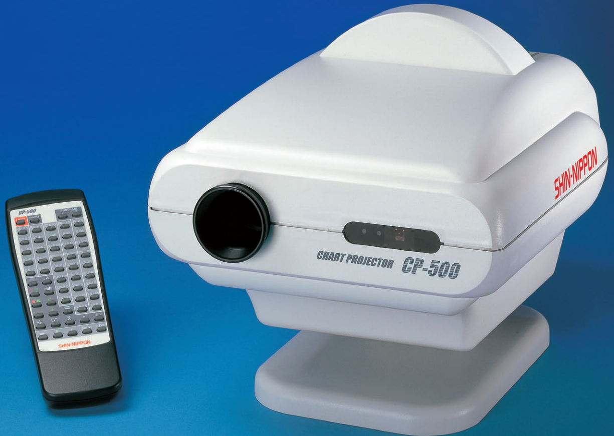
CHART PROJECTOR CP-500